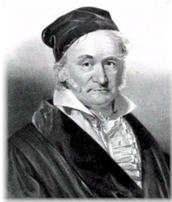
Gauss was not a baseball fan.

So if we wanted to know the number of primes less than 1,000, we could just calculate \frac{1,000}{\ln 1,000} and we've got a pretty reasonable estimate.