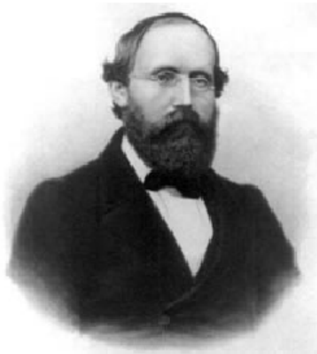
Bertrand Riemann: Hypothesizin'

After months in his basement laboratory 2 , Riemann emerged with what he thought was a remedy: a new function that he called \zeta (the Greek letter zeta) because Riemann mistakenly thought that he was Greek. It was a function that had the scientific importance of the Frankenstein monster 3 and the aesthetic appeal of, well, the Frankenstein monster. Take a look at this